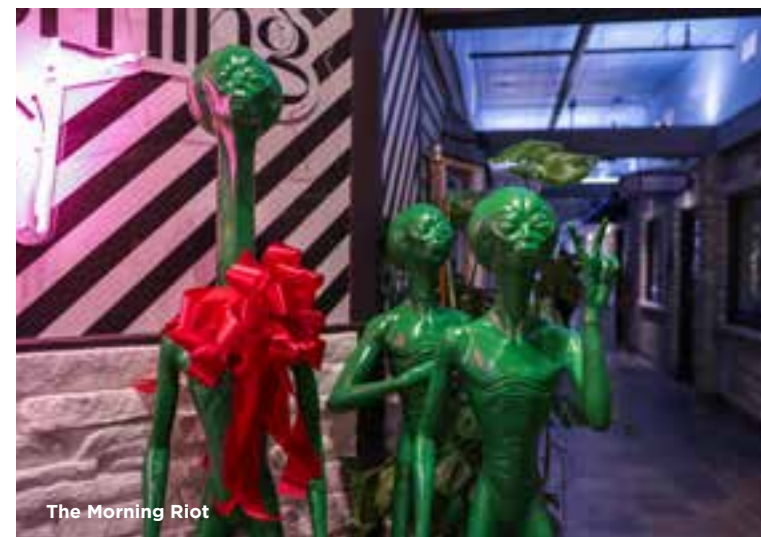
The Morning Riot

Originally inspired by similar concepts in larger cities, Bellefontaine's Umbrella Avenue quickly evolved into more than just a photo backdrop. It became a gateway experience - drawing people toward a side of downtown they may have otherwise passed by. Local shops near the alley saw increased foot traffic, and events began spilling into the space.