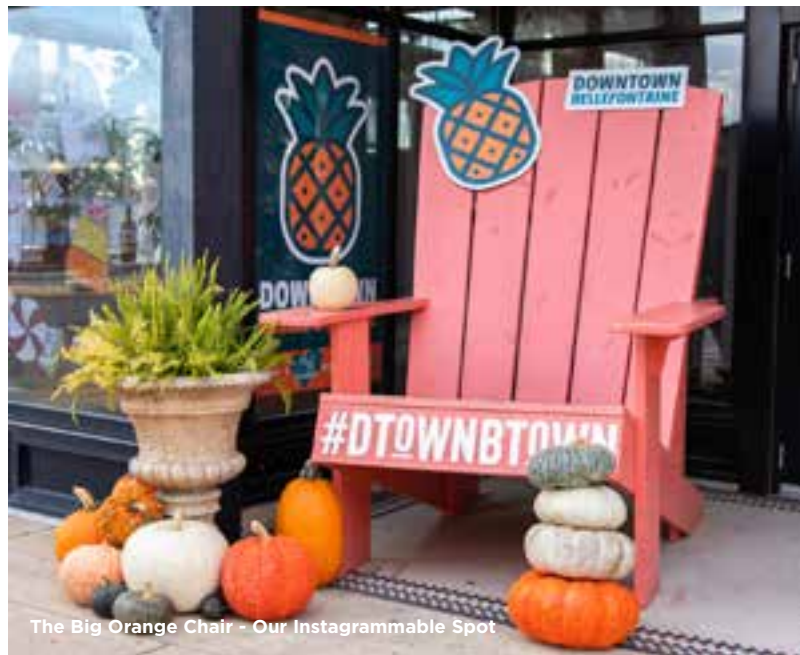
The Big Orange Chair - Our Instagrammable Spot