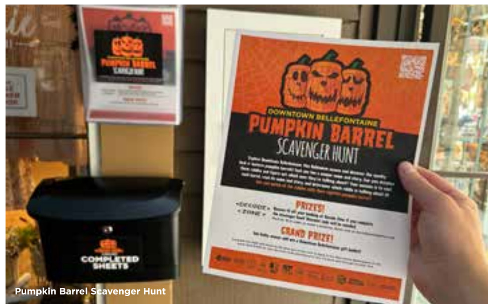
Pumpkin Barrel Scavenger Hunt