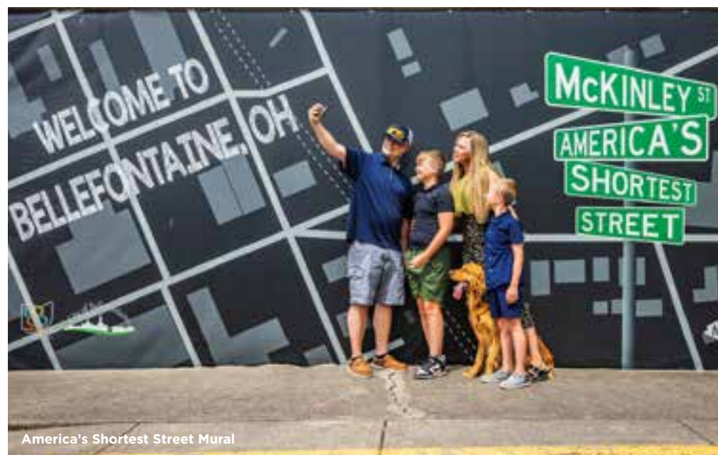
America's Shortest Street Mural