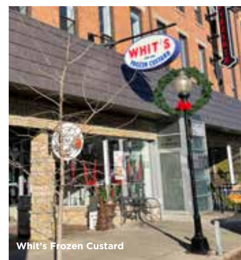
Whit's Frozen Custard