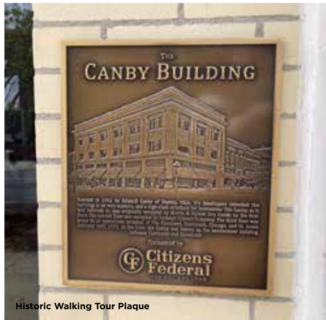
Historic Walking Tour Plaque

In the winter, the umbrellas come down and are replaced with twinkling lights, evergreen garland, and a mistletoe booth. The transformation into Mistletoe Avenue reflects Bellefontaine's adaptive approach to placemaking, one that keeps spaces relevant and fresh throughout the year.