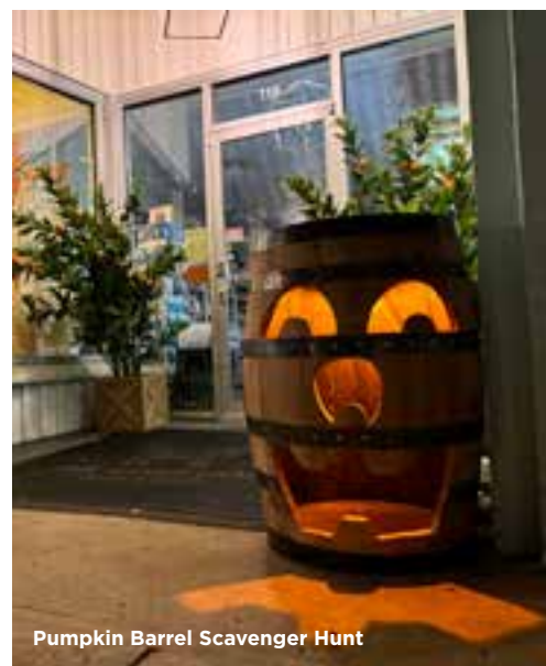
Pumpkin Barrel Scavenger Hunt