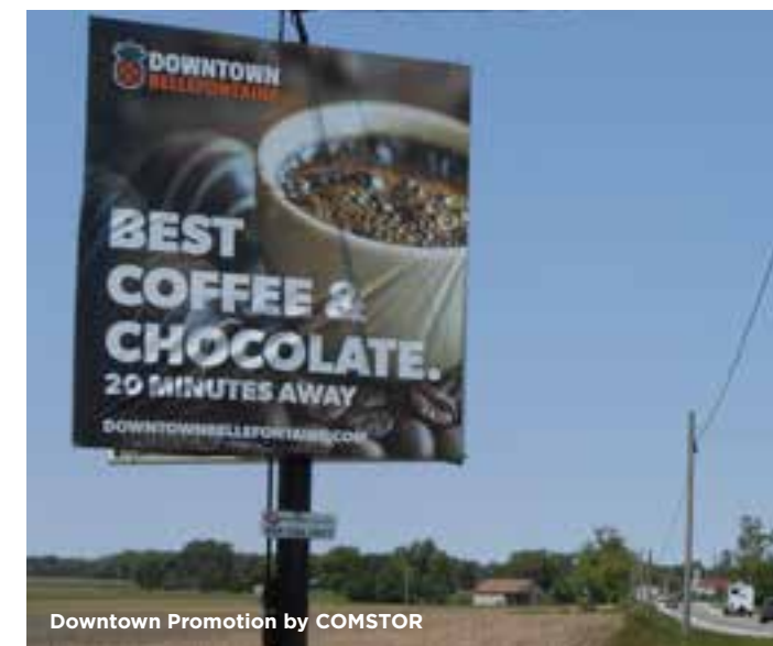
Downtown Promotion by COMSTOR